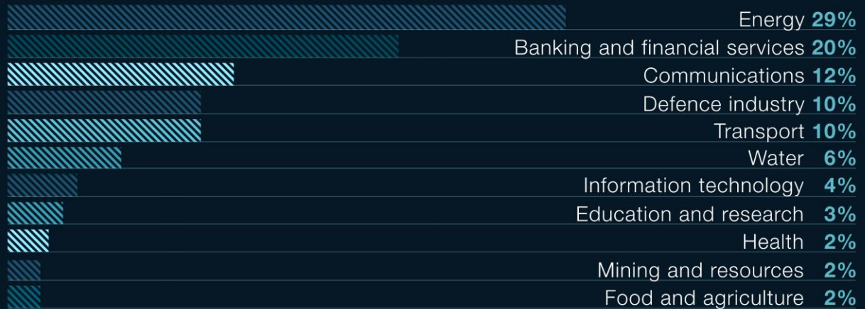
Figure 2: Incidents responded to by CERT Australia affecting systems of national interest and critical infrastructure in 2014